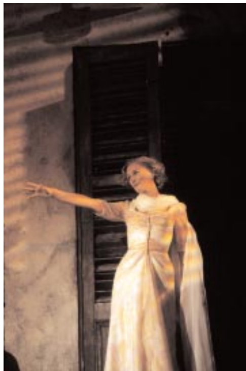
Glenn Close