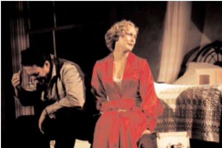
Robert Pastorelli, Glenn Close

Williams grew up during the Depression, flirting with radical politics and regarding himself as something of a 'revolutionary'. He was drawn to theatre that addressed the concerns of the world. Theatre was no longer a place to be simply entertained, when on the streets people were homeless and starving. He debated political corruption, rarely voted, denounced America's war involvements and, as a homosexual, found himself harassed and threatened in a brutal world. A world without freedom to speak one's mind and to be the person one wants to be.