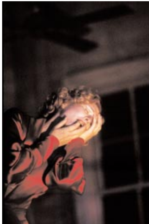
Glenn Close

Nothing had prepared the audience for the searing and complex adult themes of the play. One critic called it the product of an “almost desperately morbid turn of mind” . In contrast, another described it as “a revelation. A lyrical work of genuine originality and disturbing power” . Such were and continue to be the extreme reactions to the play.