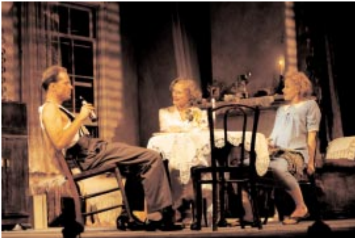
Iain Glen, Glenn Close, Essie Davis

Williams' grandmother was a music teacher, and his mother was a singer. Music to Williams was a major source of inspiration. His foreword to Camino Real talks of jazz experiments which are "a new sensation of release, as if I could ride out like a tenor sax, taking the breaks in a Dixieland combo or a piano in a bop session" . Overlaying music, sound, light, and textures, Williams was able to blur the line between realism and subjective expressionism.