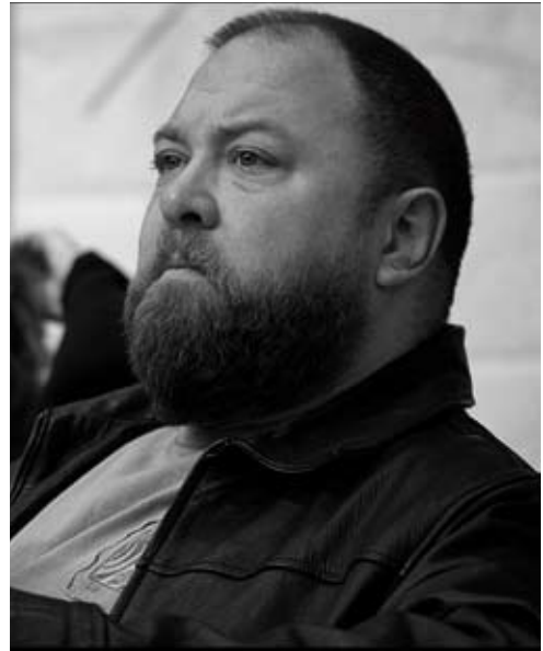
Top: (Mark Addy)