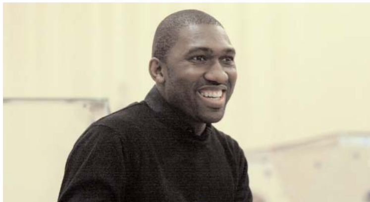
Kwame Kwei-Armah

The only true elevator in society is education. The only way to access that is through self-motivation. I was a 'B' grade student at school and didn't perceive myself in academic terms. My motivation for self-education as a man was political, personal and social, and I think we all have an obligation to fulfil our potential and not leave it to waste.