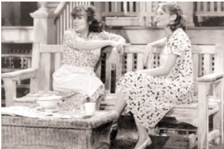
Julie Walters Catherine McCormack

character whose idealism was the source of cruelty. This becomes a minor but important theme in All My Sons , never fully developed but a disturbing presence. More significantly still, he learned from Ibsen the importance of the past which exerts its pressure on the present. One of his central concerns, he has said, is how the chickens come home to roost.